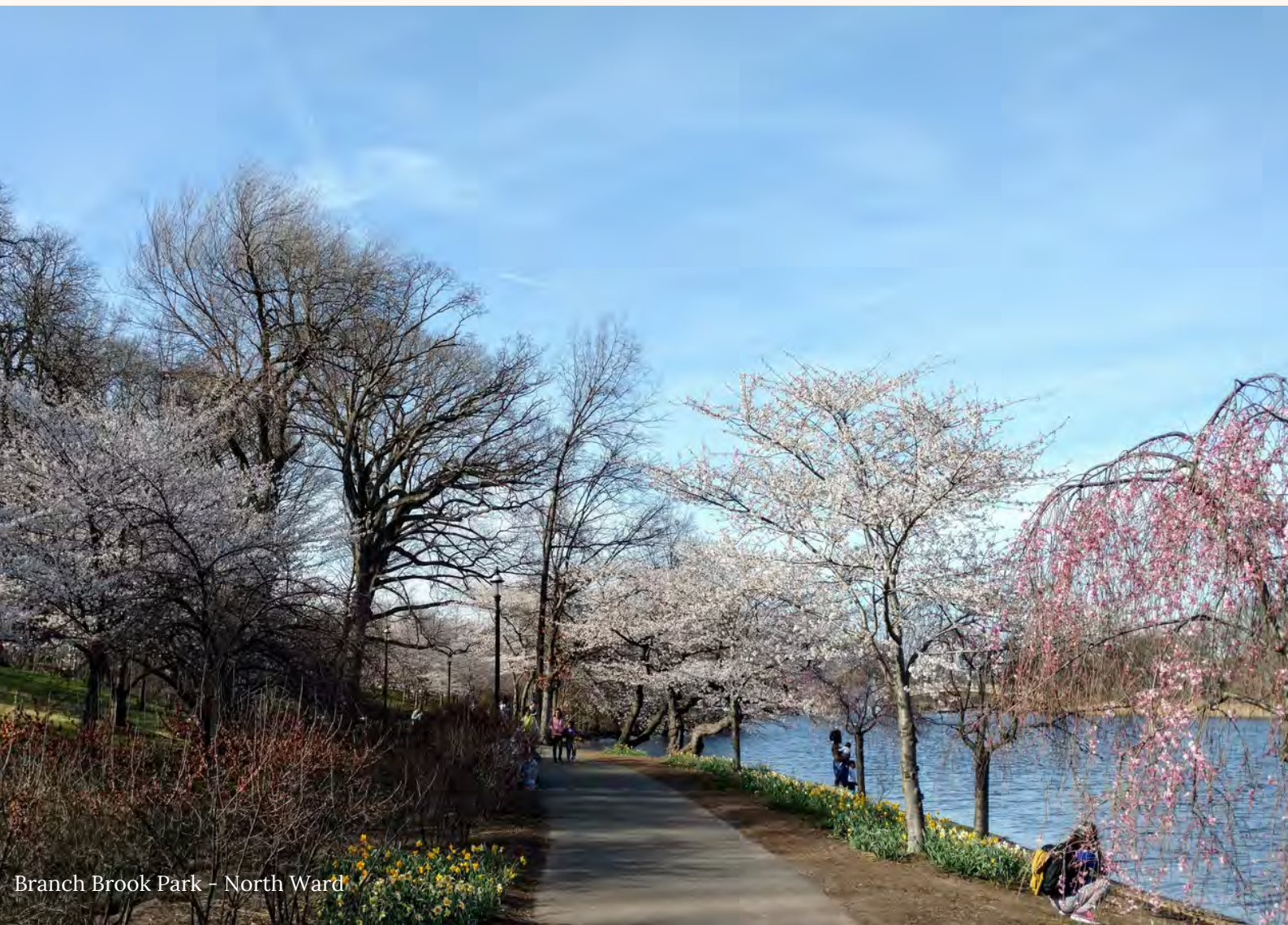
Branch Brook Park - North Ward