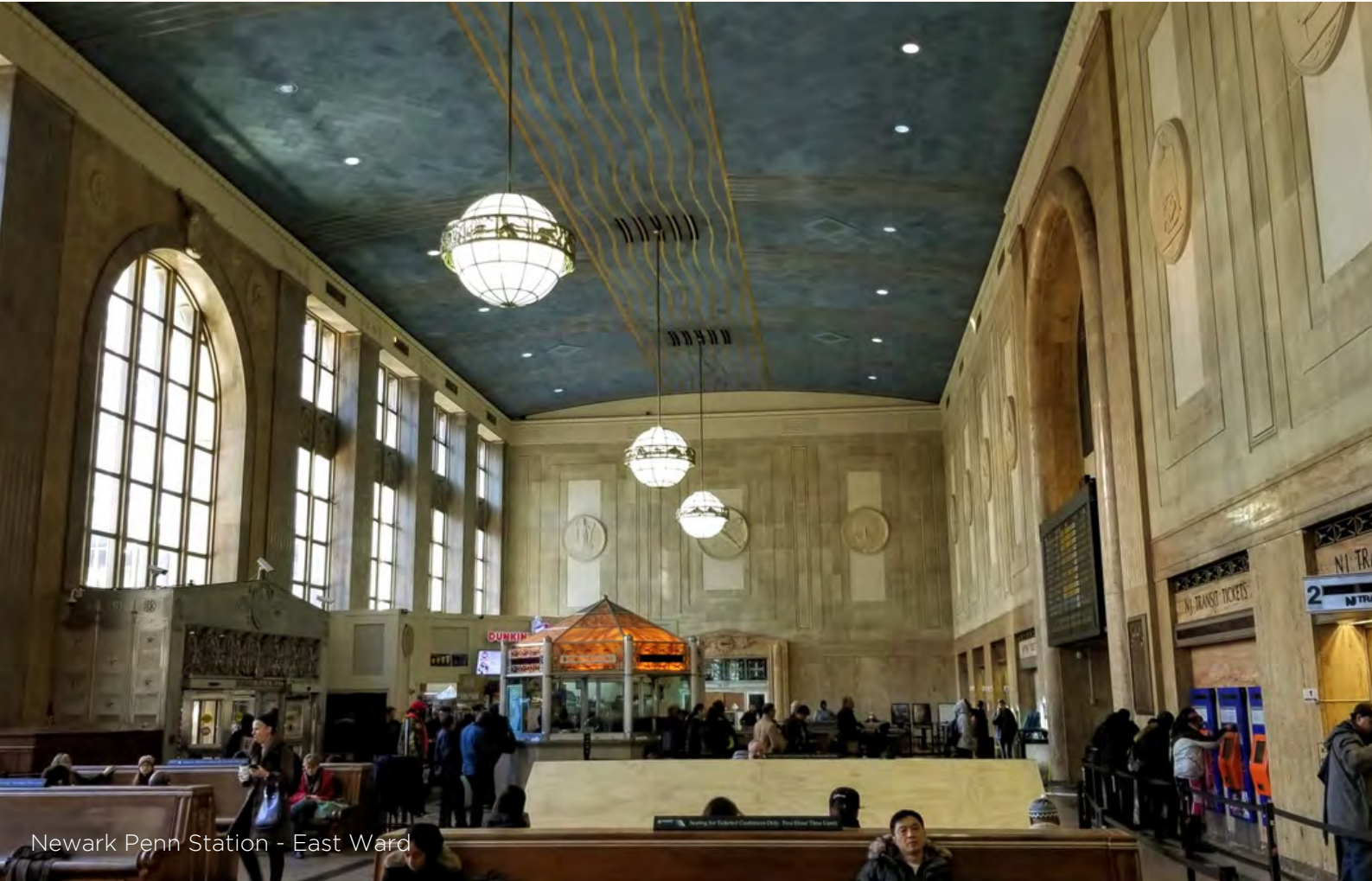
Newark Penn Station - East Ward

Structured around a cadence of quarterly Members Meetings, which include the Mayor, the work of the Alliance is broadly divided in two spheres of work— Building Transformative Systems and Delivering Transformative Projects —all conducted under a shared vision of advancing Racial Equity.