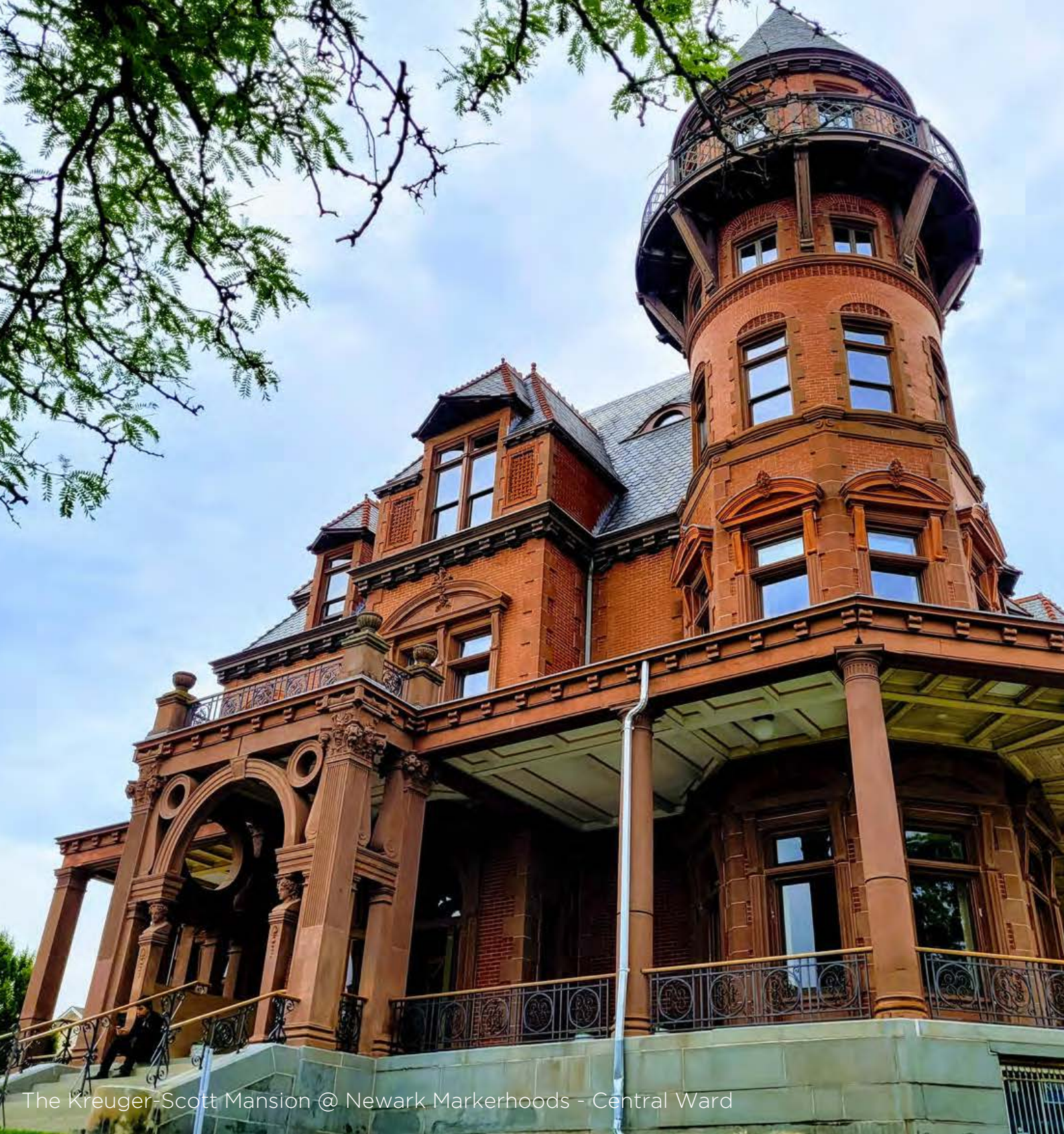
The Kreuger-Scott Mansion @ Newark Markerhoods - Central Ward