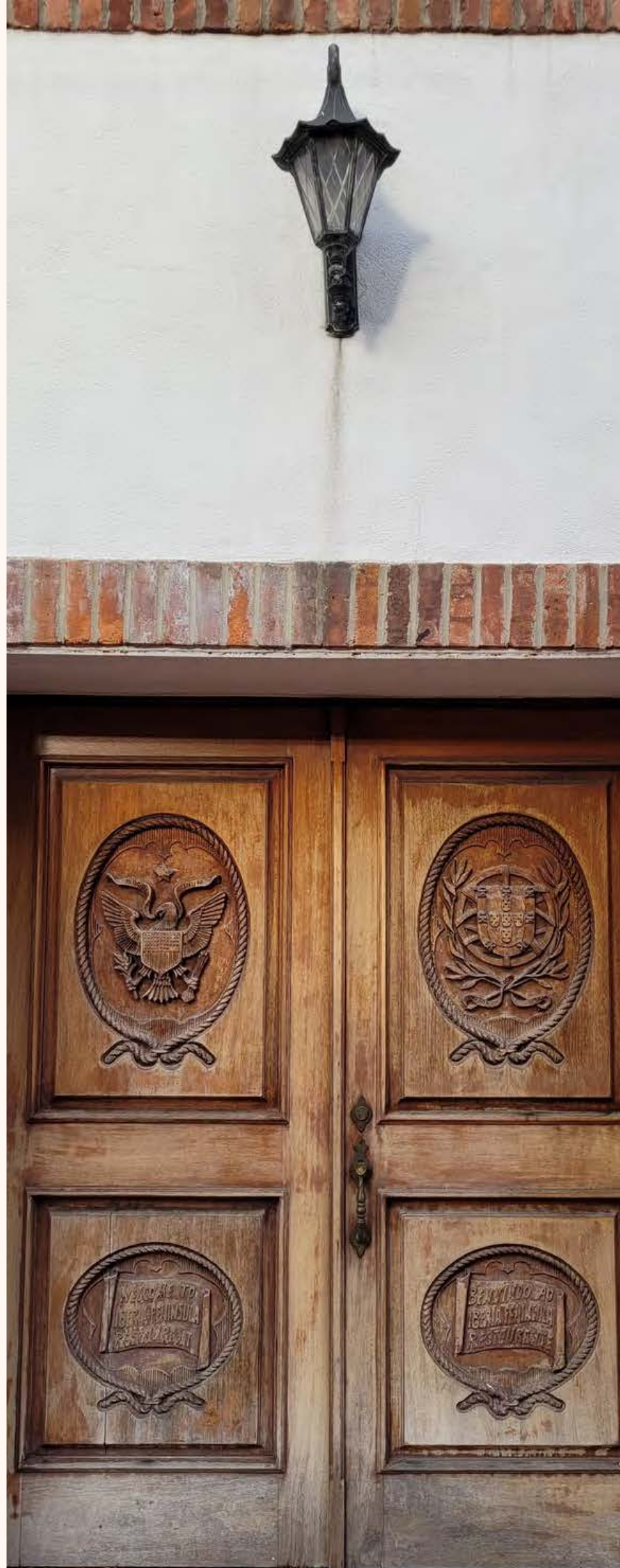
Old Iberia Peninsula Restaurant Door - East Ward

It is also an organization of diverse leaders, from arts, culture, education, business, real estate, tech, community, and healthcare institutions, who themselves come from diverse backgrounds. Building this volunteer leadership organization to contain the multitudes of all those doing good work in Newark is an ongoing commitment and task of the Alliance and each Member.