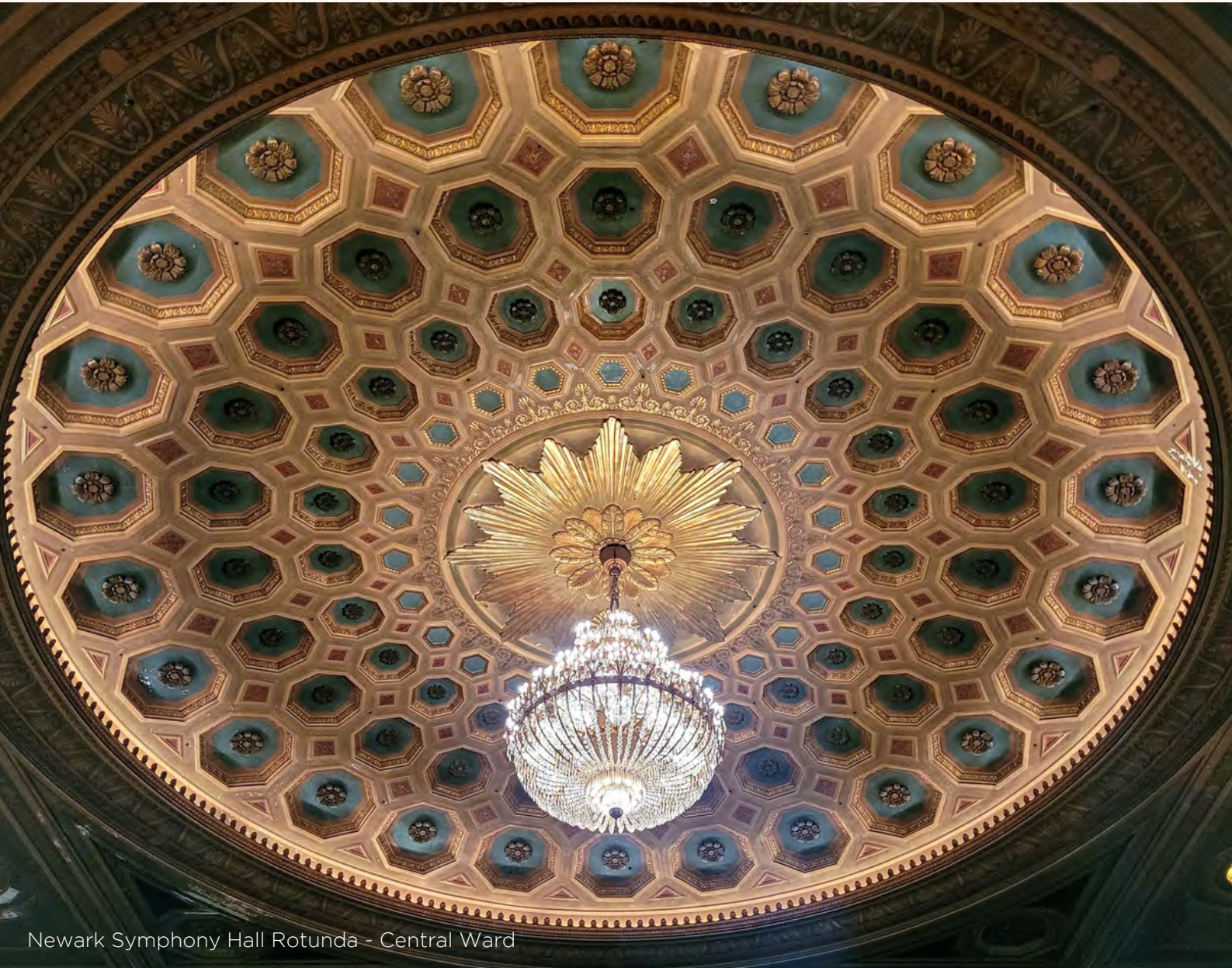
Newark Symphony Hall Rotunda - Central Ward

All of our work would be devalued if it were not firmly rooted in the cause of advancing Racial Equity. From broadband and business attraction to housing and homelessness, nothing is removed from this cause. The Alliance will build on its success in developing a unique understanding of the barriers to Racial Equity among all of Newark's sectors and industries by connecting Members to Racial Equity and inclusion technical assistance, tools—including frameworks—and comprehensive capacity-building exercises.